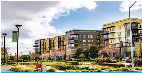
SENIOR MORTGAGE LOANS